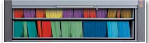
LATERAL FLAT FILES