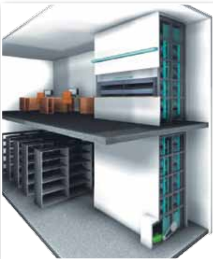
THROUGH THE CEILING OR FLOOR