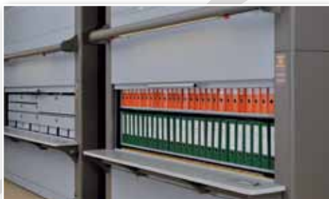
LEVEL ARCH FILES