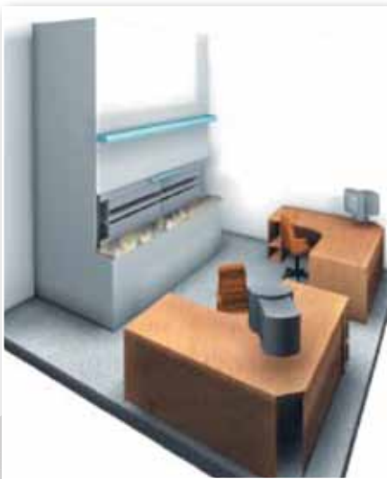
AGAINST A WALL