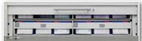
VERTICAL HANGING POCKETS