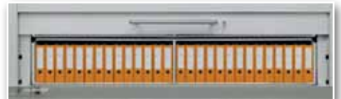
BOX / LEVER ARCH FILES