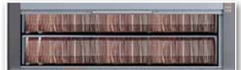
LATERAL HANGING POCKETS